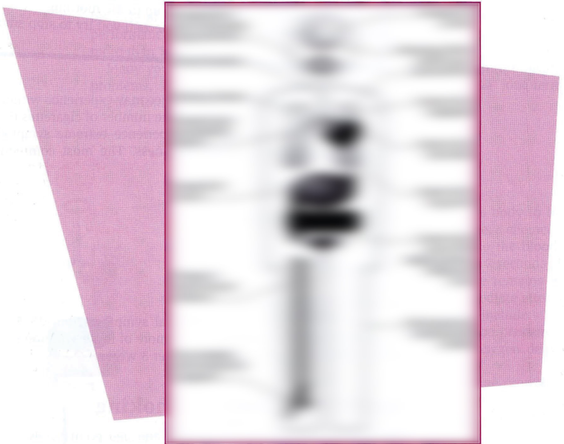
Figure 4.5 ● The long-term effects of smoking. Health Department, South Pacific Division, Seventh-day Adventist Church

Smoking damages the lining of blood vessels and increases the risk of blood clots. It also makes the heart work harder by increasing blood pressure and heart rate. All of these factors may lead to the blocking of the arteries around the heart, which will cut off the blood supply to the heart. This may cause a heart attack.