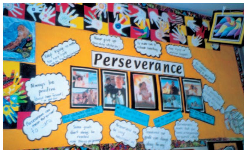
Primary students identify perseverance qualities exhibited by the characters in one of the texts used in the Multi-stage Unit of Work on Perseverance.