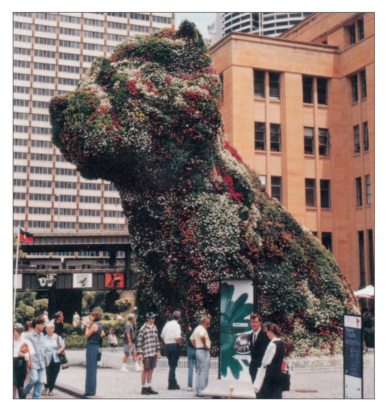
Plate 3: Photograph of audience viewing Jeff Koon's installation, Puppy , 1996, steel, live flowers and soil, 12 \times 2.5 \times 6.6 m, in front of the Museum of Contemporary Art, Circular Quay, Sydney.