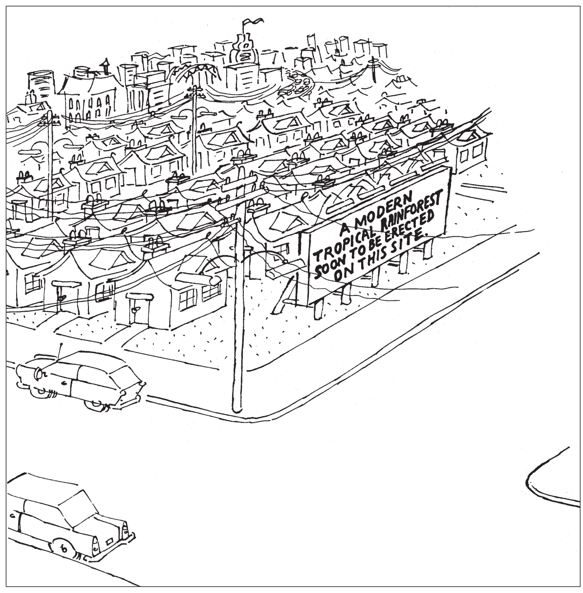
by Phil Somerville