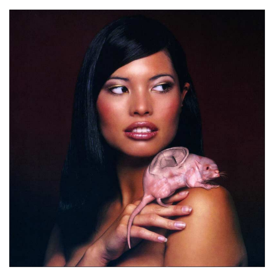
Plate 3: Patricia Piccinini, b.1965, USA, (lives and works in Melbourne, Australia) Protein Lattice – Subset Red , 1997

(b) Discuss the significance of technology to Patricia Piccinini's practice. Refer to Plates 3 and 4.