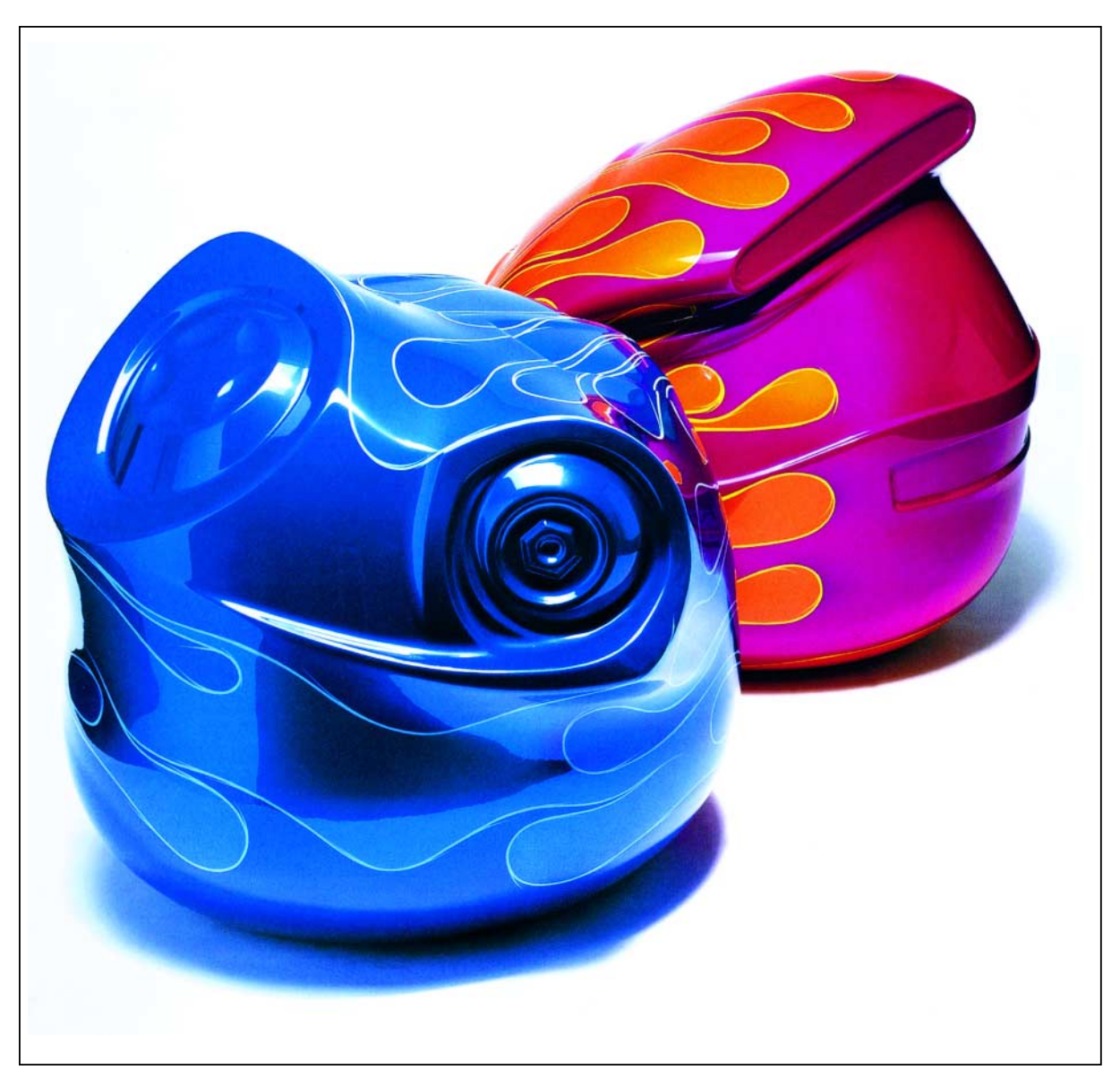
Plate 4: Patricia Piccinini, b.1965, USA, (lives and works in Melbourne, Australia) Car Nuggets GL , 2001–2002