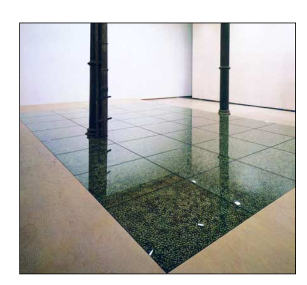
Plate 2: Floor 1997–2000 PVC figures, glass plates, polyurethane resin and fibreglass sheets The installation comprises forty sections, each 100 × 100 cm. Installation at Lehmann Maupin Gallery, New York.