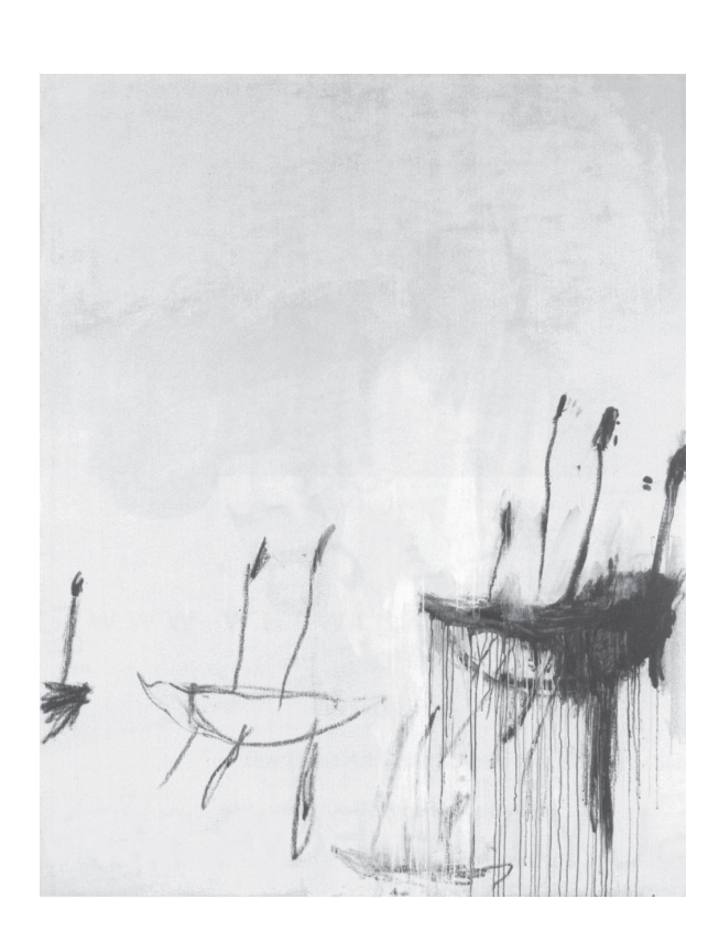
Plate 4: Cy Twombly, b. 1928, USA. Three studies from the Temeraire, 1998–1999. Three panels, oil on canvas, Left panel, 253.5 cm × 202.5 cm Centre panel, 261.3 cm × 202.5 cm Right panel, 260.3 cm × 195.5 cm Art Gallery of New South Wales. © Cy Twombly

Using the subjective frame, compare Cy Twombly's series of three paintings with Turner's work.