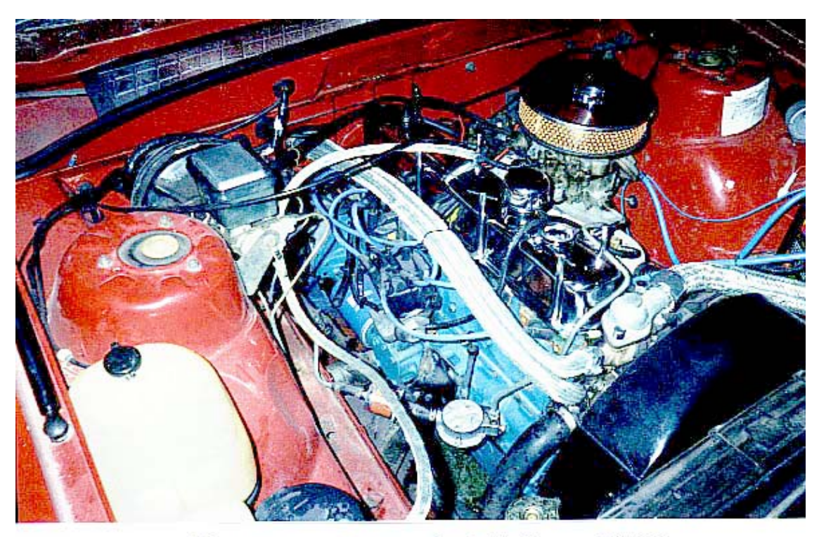
Chrome accessory installation - 8/7/02