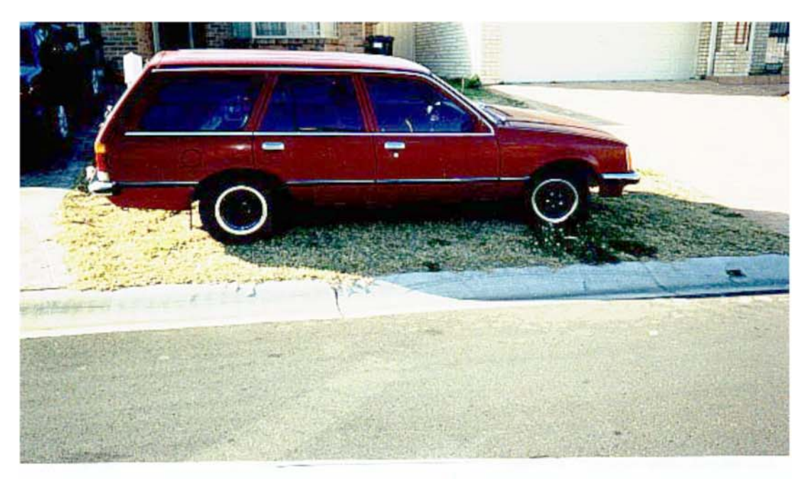
Right hand side