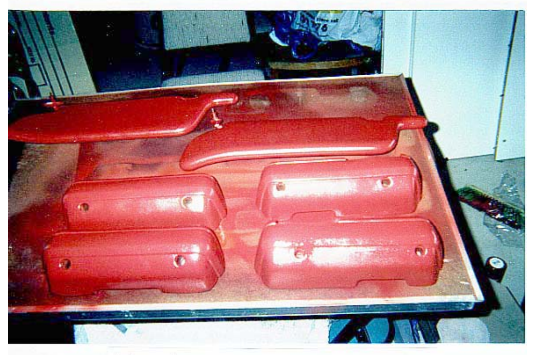
Internal components re-spray - 17/2/02