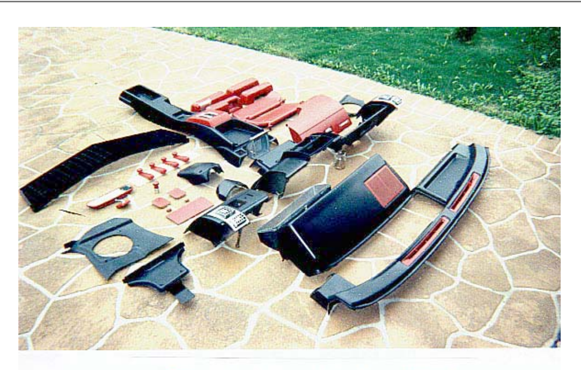
Dash & consul re-sprayed - 23/2/02