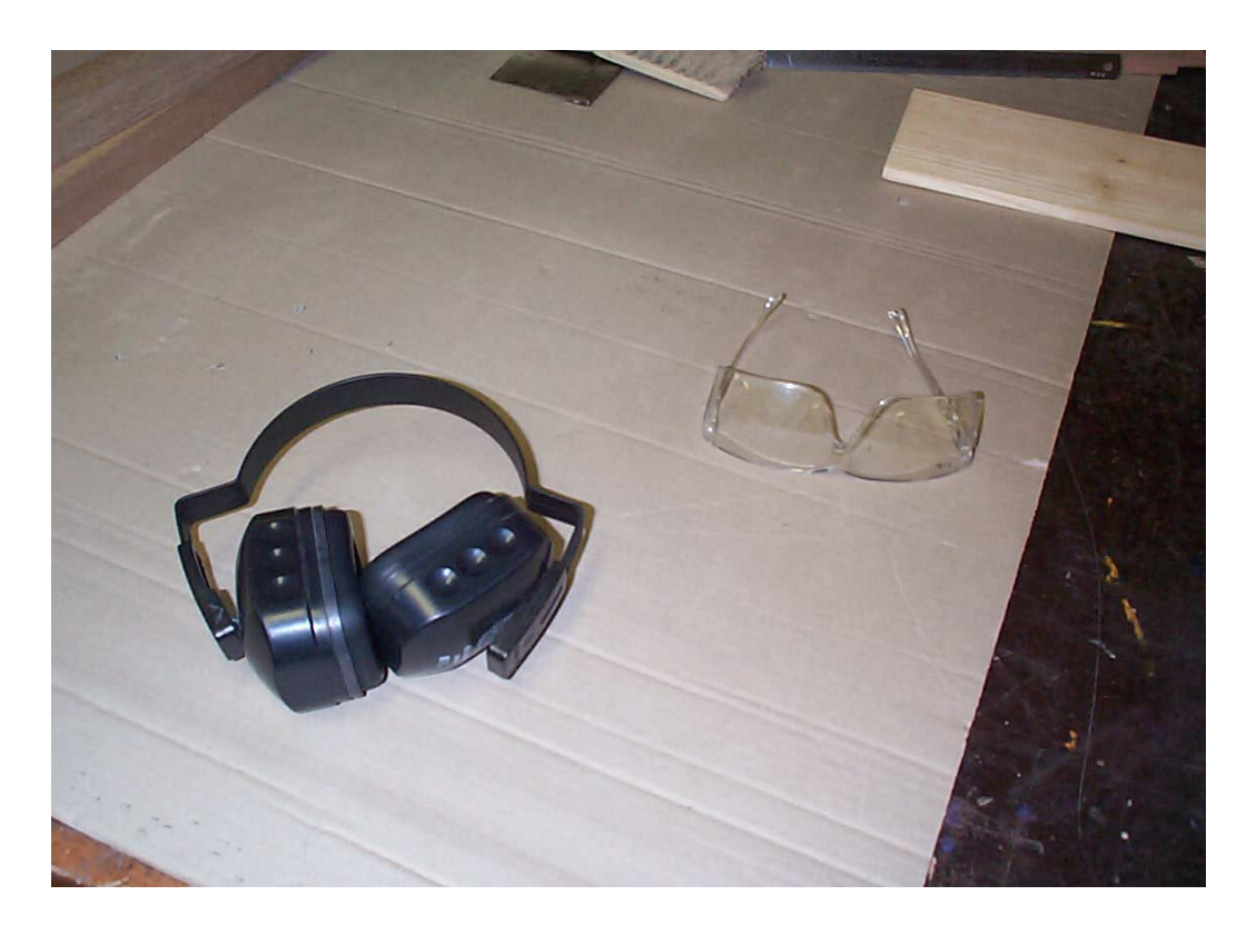
Here is the

Protection that I required and used through out the process of building my project in the above picture