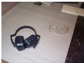
Eye Shield & Ear Muffs

Other Machinery/tools and equipment include: