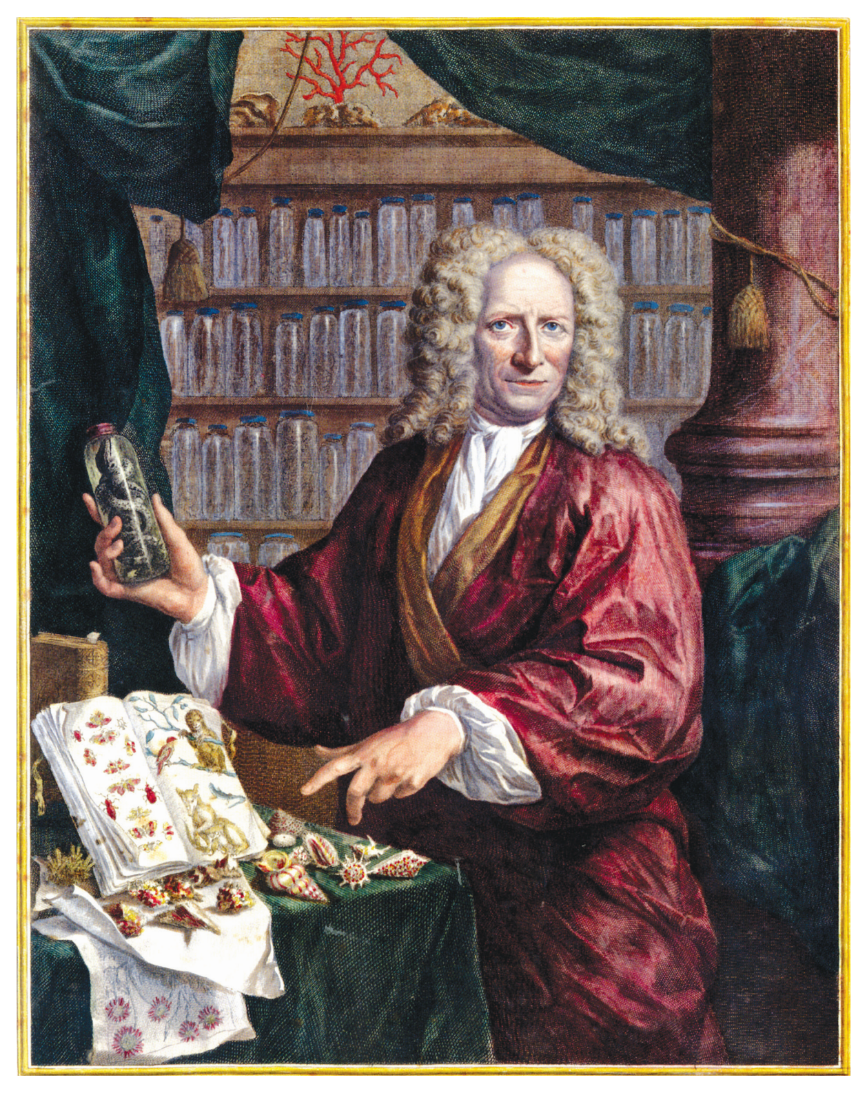
Painting of Albertus Seba by Jacob Houbraken, 1730