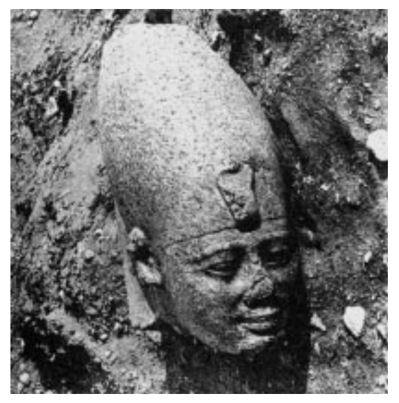
Gae Callender, The Eye of Horus, 1993, pp 128, Reed Educational & Professional Publishing

FRAGMENT OF A STONE STATUE OF AMENEMHAT I FOUND IN A TEMPLE