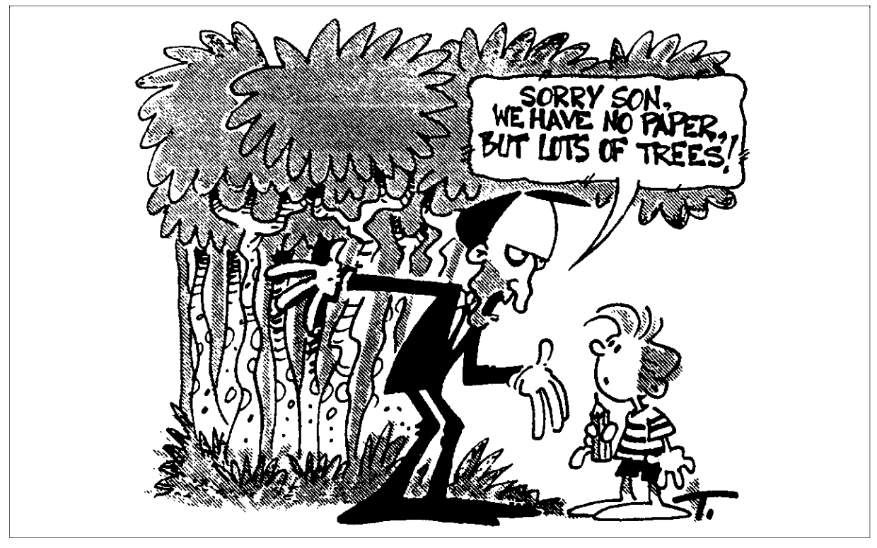
Trounce, Sunday Telegraph, 1/1/1995.

'Governments are being faced with more and more policy decisions where there is conflict between environmental and other interests.'