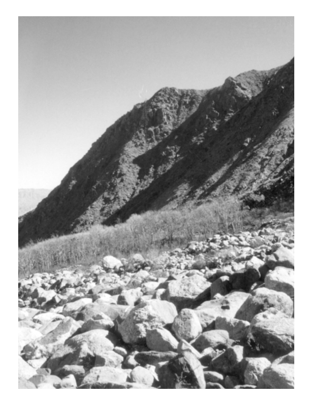
Plate 2 Plate 3