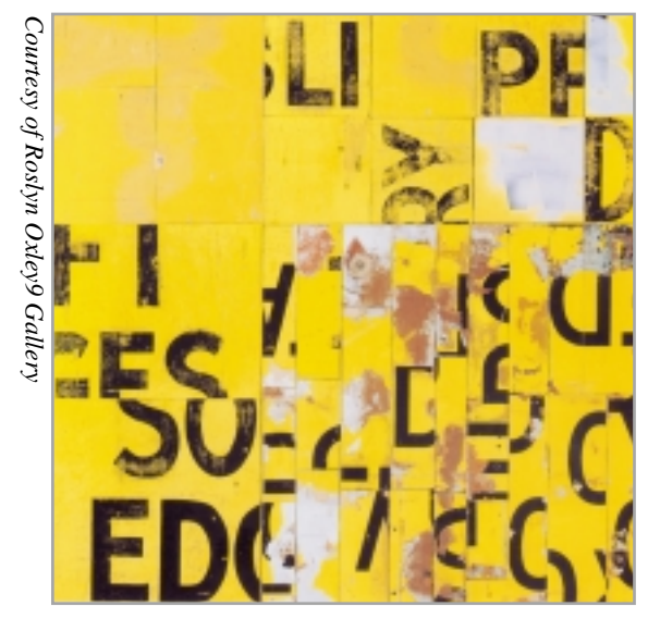
PLATE 5 Rosalie Gascoigne, b. 1917, New Zealand/Australia, Southerly Buster , 1995, retro-reflective road signs on composition board, 117 × 115 cm.

Philip Johnson, b. 1906, USA, Johnson House, (Glass House), interior view, 1949, New Canaan, Connecticut, USA. Concrete, steel, glass, wood, brick.