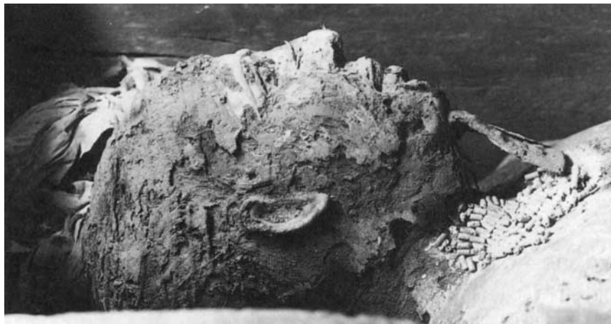
Deutsches Archäologisches Institut, Cairo, pp. 38 (top)