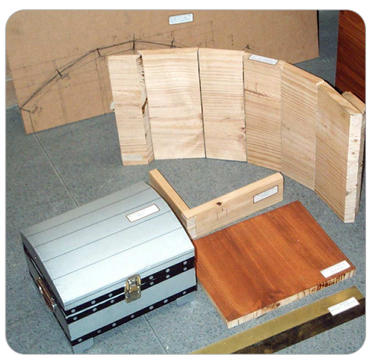
PROTOTYPING A CONCEPT